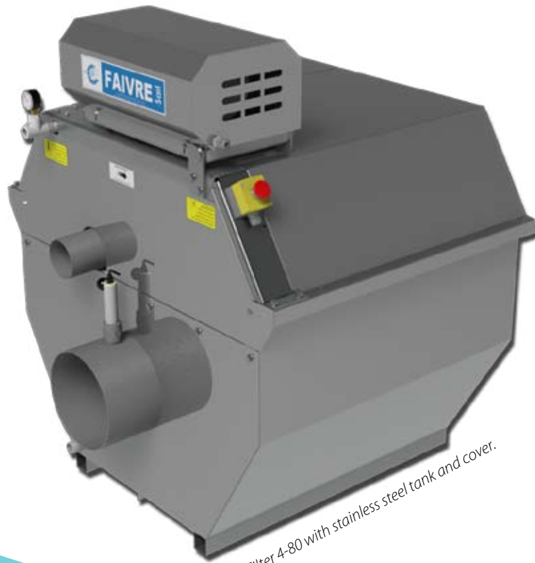
Filter 4-80 with stainless steel tank and cover.