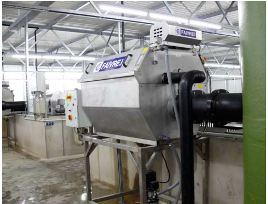
A filter 4-80 installed on a recirculation system.

Pictures and technical data are not contractual. FAIVRE Sarl can bring any modification to its equipment at any time.