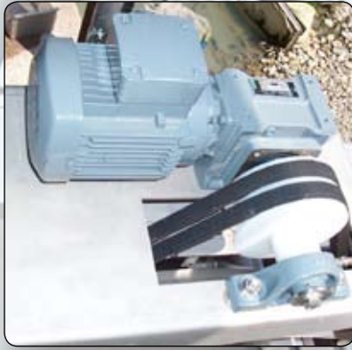
Drum driven by belt, simple and economical.