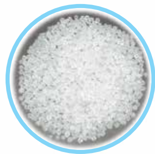
4mm – 5mm Biofilter media

Biological filtration is the most effective method of removing toxins (ammonia) and breaking it down into nitrites and then into nitrates which provide food to your aquatic plants (referred to as the Nitrogen Cycle). This is accomplished by using naturally occurring bacteria and giving it a place to live in the Biofilter media where it is exposed to large quantities of food and oxygen.