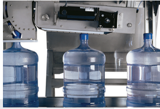
BOTTLED WATER FILL LINES