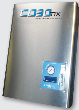
CD30nx Ozone Generator